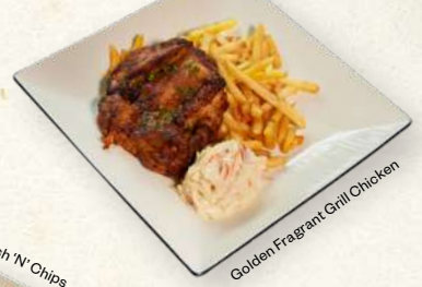
Golden Fragrant Grill Chicken