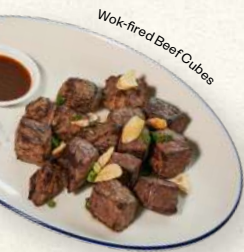
Wok-fired Beef Cubes