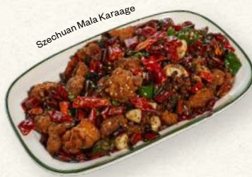
Szechuan Mala Karaage