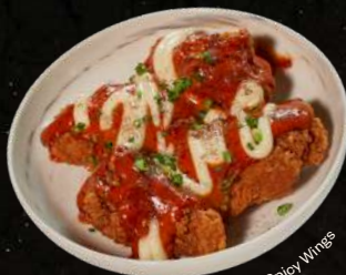
Tippy® Spicy Wings