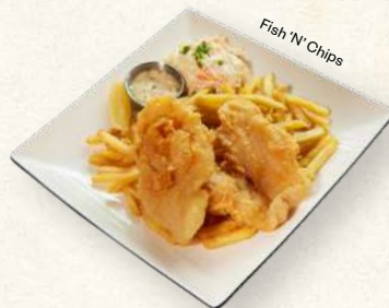
Fish 'N' Chips