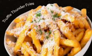
Truffle Thunder Fries