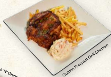
Golden Fragrant Grill Chicken