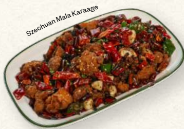
Szechuan Mala Karaage