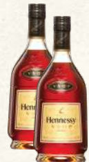
Twin Hennessy VSOP 428 (U.P. 536)