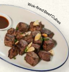
Wok-fired Beef Cubes