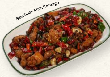
Szechuan Mala Karaage