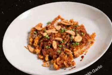
Fermented Pork Belly with Garlic