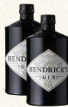
Twin Hendrick's Gin 328 (U.P. 416)