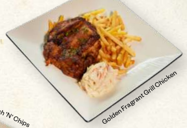
Golden Fragrant Grill Chicken