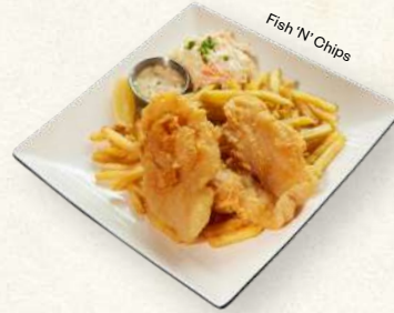
Fish 'N' Chips