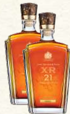
Twin John Walker & Sons XR 21 528 (U.P. 656)