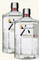
Twin Roku Gin 328 (U.P. 416)