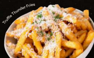
Truffle Thunder Fries