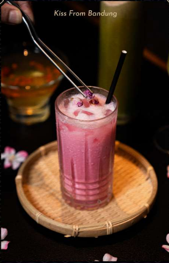
Kiss From Bandung