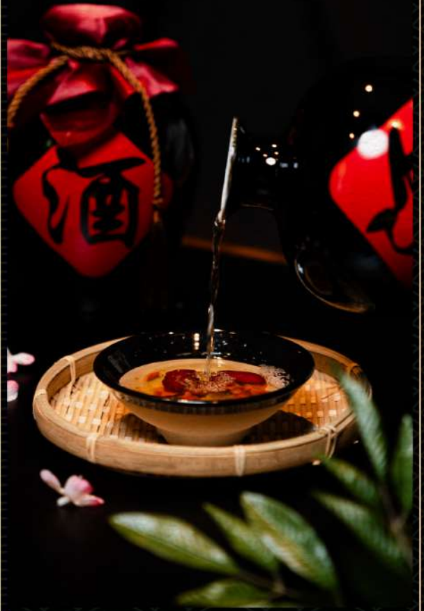
Back In The Days