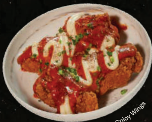
Tipsy® Spicy Wings