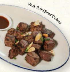
Wok-fired Beef Cubes