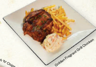
Golden Fragrant Grill Chicken