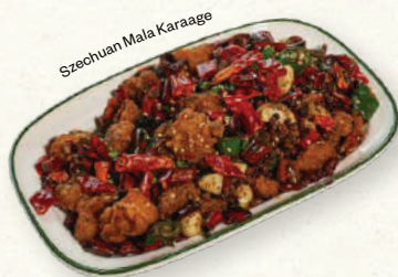
Szechuan Mala Karaage