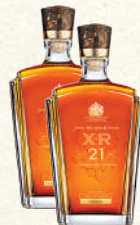
Twin John Walker & Sons XR 21 528 (U.P. 656)