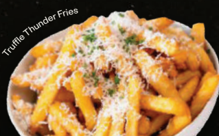
Truffle Thunder Fries