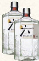
Twin Roku Gin 328 (U.P. 416)