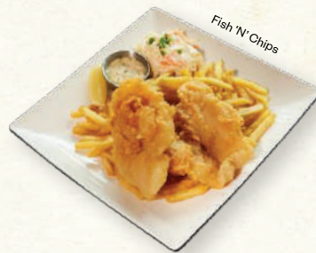
Fish 'N' Chips