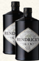
Twin Hendrick's Gin 328 (U.P. 416)