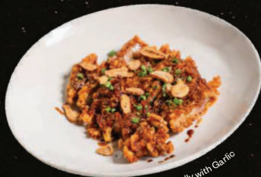
Fermented Pork Belly with Garlic